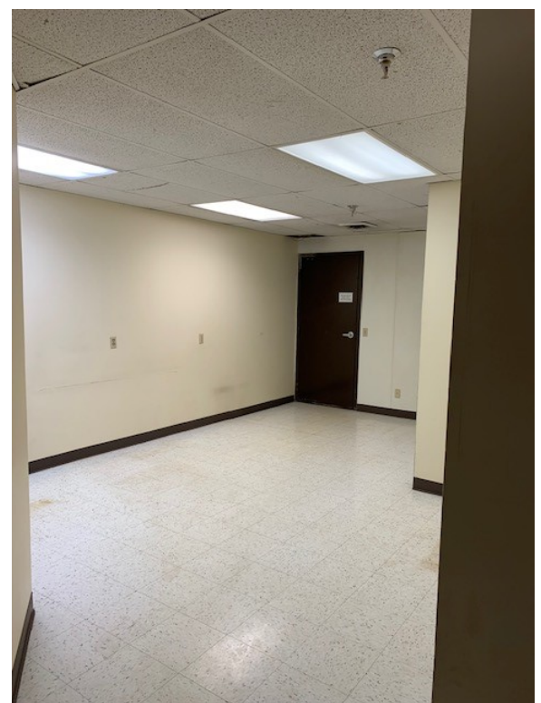
FOR ADDITIONAL INFORMATION PLEASE CONTACT